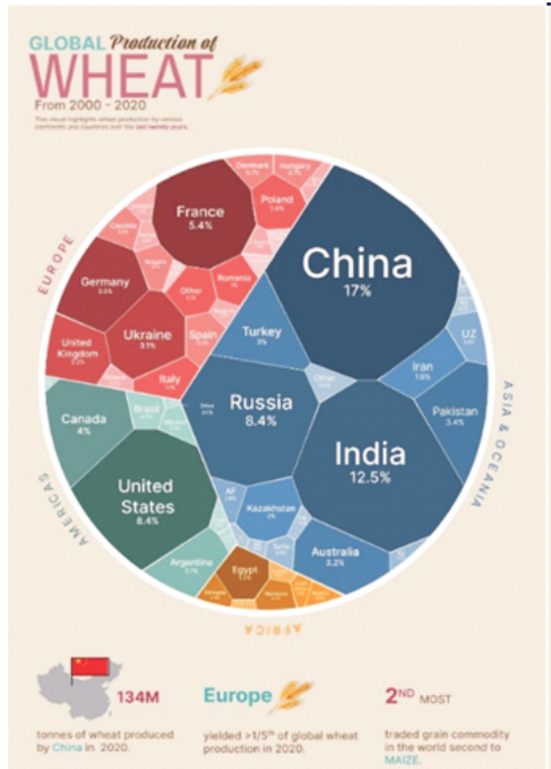
Figure 1. Worldwide wheat production

China, India stores much of its wheat at home to meet the increasing demand for food across the country. Russia, the world's third-biggest wheat producer, is the largest exporter of wheat. In 2021, the country exported wheat worth about $7.3 billion, or around 13.1% of the global total.