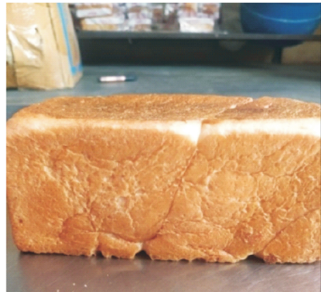
Figure 4. Trial 4