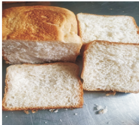
Figure 5. Sliced bread of trial 4