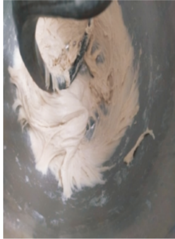
Figure 1. Dough in mixer

compression. CSL's impact is most likely a result of the way it strengthens dough (Garzón et al. , 2018). At the junction of gluten and starch, dough-strengthening emulsifiers can create liquid films with a lamellar structure (Bel et al. , 2018). They increase gluten's capacity to form a film that traps the gas produced by the yeast, proportioning an increase in volume (Krog, 1981). A soft, delicate crumb texture distinguishes stearyl lactylate-containing loaves (Sluimer, 2005). The bread crumb's "closed" features were retained with the increased volume provided by CSL.