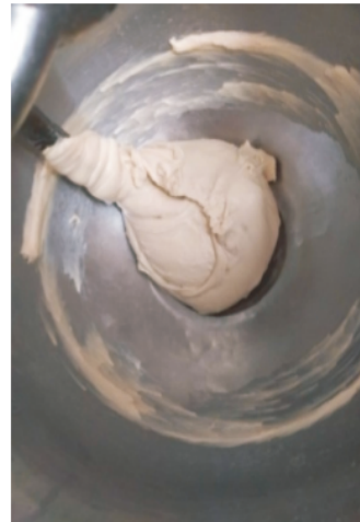
Figure 2. Mixed dough