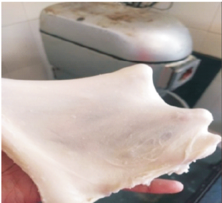
Figure 3. Gluten network