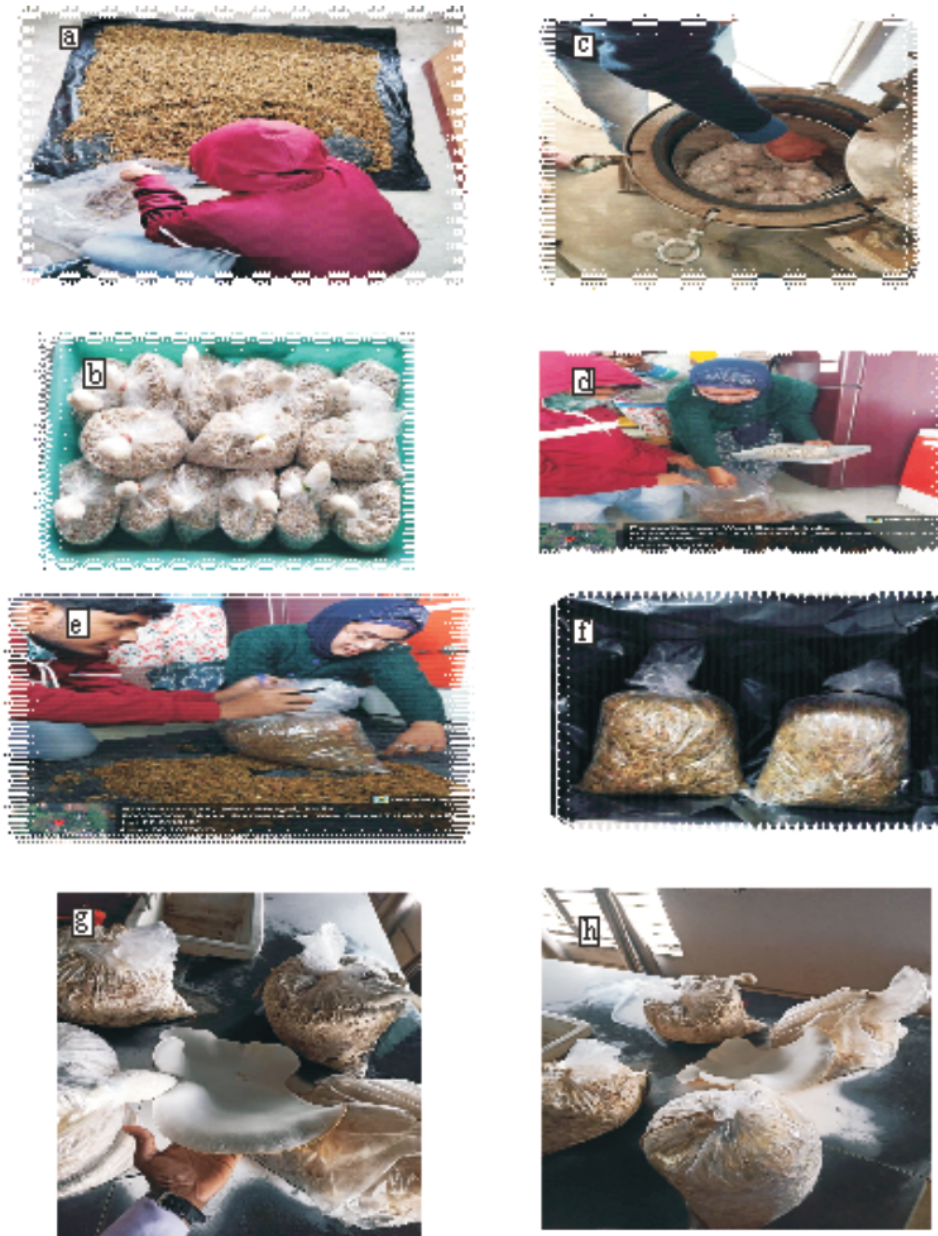
Figure 1. Milky mushroom cultivation in our laboratory: a) substrates, b) spwan, c) steam sterilization at autoclave, d) spwan spreading into the bed, e) hole the mushroom bed f) mushroom bed in dark chamber, g) mature fruit body, h) immature pinheads and mature fruit body

consistency in the supply of mushrooms between March to May by cultivating Calocybe indica . Cultivation of this mushroom is very simple and low-cost production technology, which gives consistent growth with high biological yield. The rice straw was the best substrate for the commercial cultivation of Calocybe indica (Sahu and Gupta, 2024). Integration of mushroom cultivation is definitely making the venture cost effective and profitable. If, it can be popularized among the rural people, it will enhance the livelihood and uplift the socio-economic condition of the area that could produce mushroom products from the different substrates (paddy and wheat straw) and help to dispose those substrates ultimately save the environmental pollution .